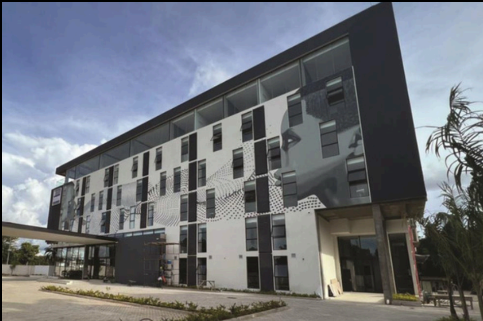
BK PROJECTS - Urban Lusaka Hotel, Zambia