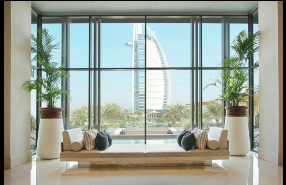
BK PROJECTS - Jumeirah Al Naseem Hotel, Dubai