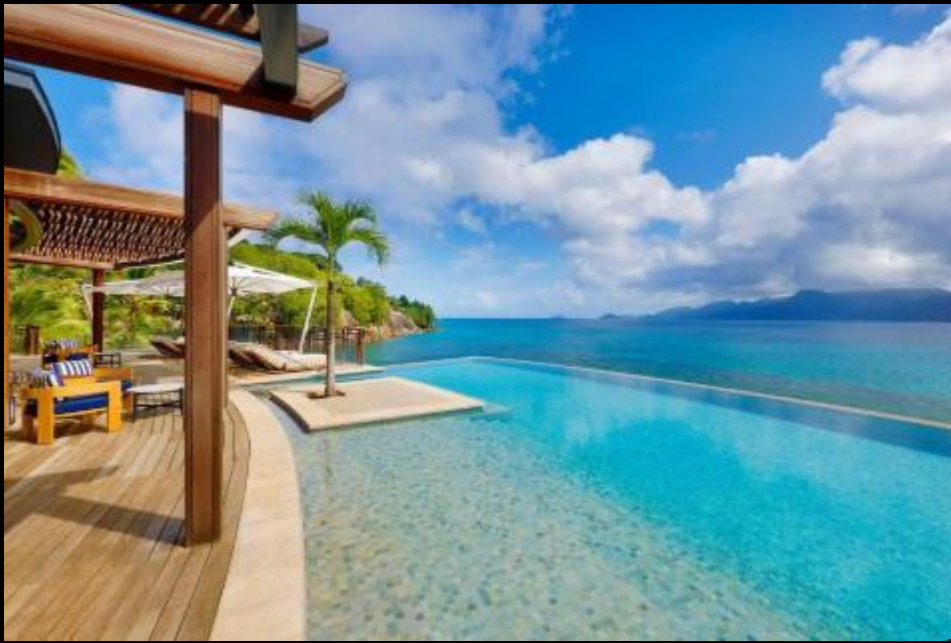
BK PROJECTS - Hilton LXR Mango House Resort Hotel, Seychelles