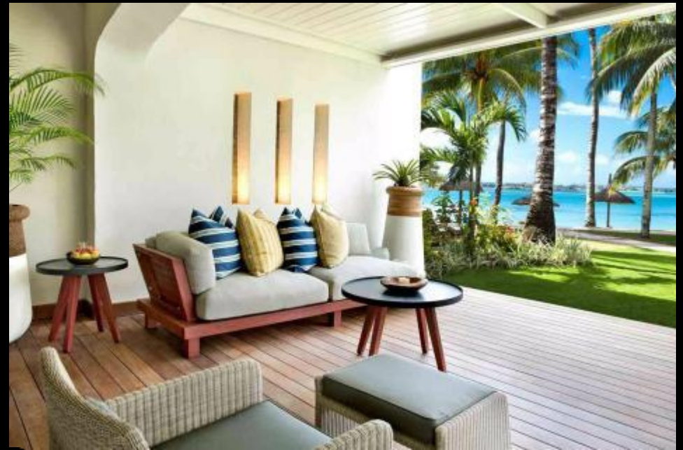
BK PROJECTS - One & Only Le Saint Geran Hotel, Mauritius