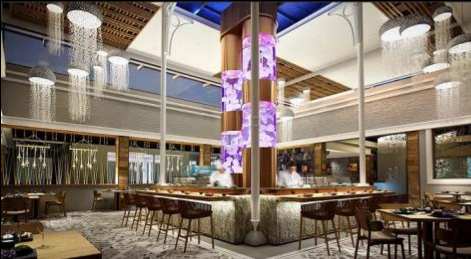
LLP – Le Suffren Hotel – Port Louis, Mauritius